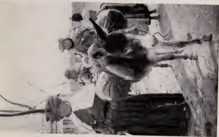
Hill women on the way to market with their pack donkeys